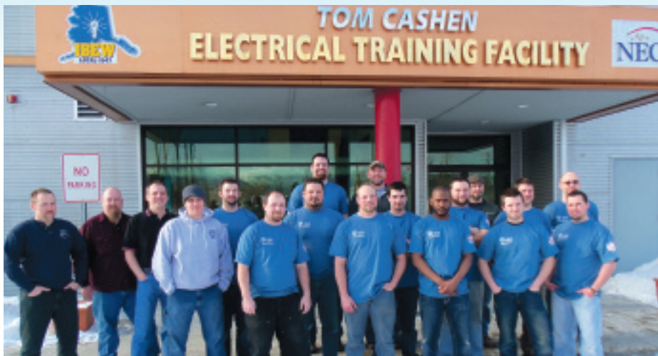
Local 1547 Electrical Training Center graduates.