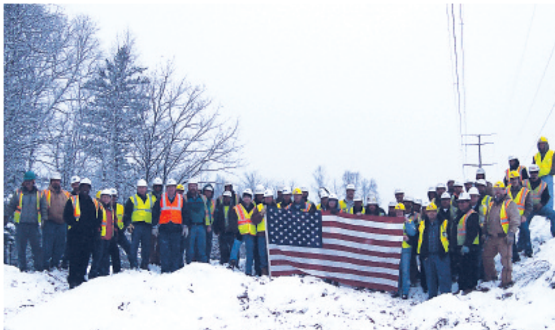
More than 400 IBEW members helped construct the massive Arrowhead-Weston transmission line, which connects energy markets in Minnesota, Wisconsin and Manitoba.

The nation's electrical grid network is both aging and underdeveloped. Some sections are nearly six decades old and weren't designed to carry massive loads of power over long distances. This creates energy backlogs that are hampering the development of the green sector at a time when our nation increasingly needs more renewable power. With more eminent domain laws