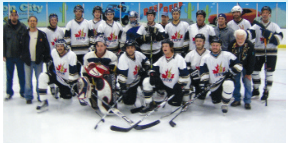
Local 1739 hockey team members.