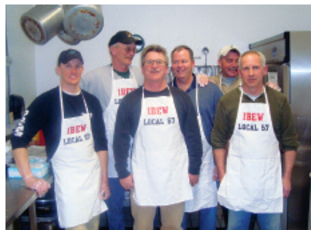
IBEW Local 57 members volunteer at the City Of Refuge in Idaho Falls, Idaho.

We are also helping out at the local Big Brothers/Big Sisters golf tournament with a hole sponsorship and volunteers. Get out and participate in the community. Many of our members have quietly supported and volunteered in their communities. This