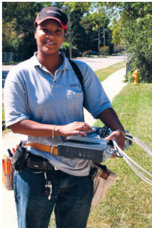
Union activists worry that Comcast's low-road workers' rights model will spread throughout the telecommunications industry.

Employees complained of having no job security or regular pay raise schedules. "It is the way