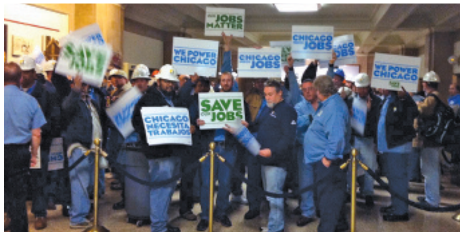
Local 15 members rally to save jobs.

L.U. 15 (u), DOWNERS GROVE, IL—The City of Chicago has a proposed Clean Air Ordinance that, if passed, could force the closure of Fisk and Crawford power stations by July 2012. Hundreds of our members attended a city meeting to oppose air pollution standards that are impossible to meet in the given time frame. As of