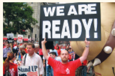
Mobilization efforts are underway as IBEW negotiators begin talks with Verizon.