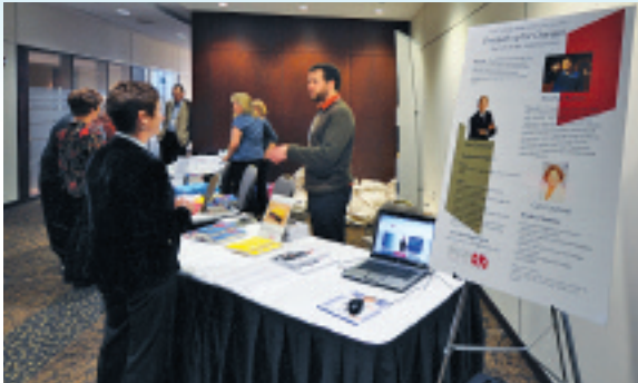
Attendees gather at Local 37 Training Trust Fund conference.

friendly approach encouraged participation.