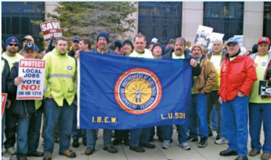
Local 531 contingent attends March union rally.

the right wing. We owe a debt of gratitude to the Democrats who fled the state to stop the anti-worker legislation and also to those few Republicans who do understand and support our positions. The GOP's whole strategy now is to eliminate collective bargaining and weaken the voices of the middle class. I thank all of our members who joined us at the Indiana Statehouse for demonstrations.