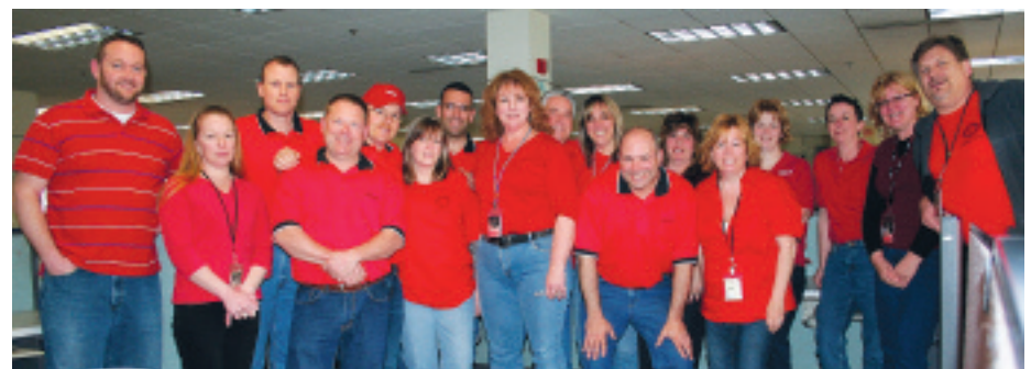
Local 2325 members wear their solidarity colors in Marlboro, MA.