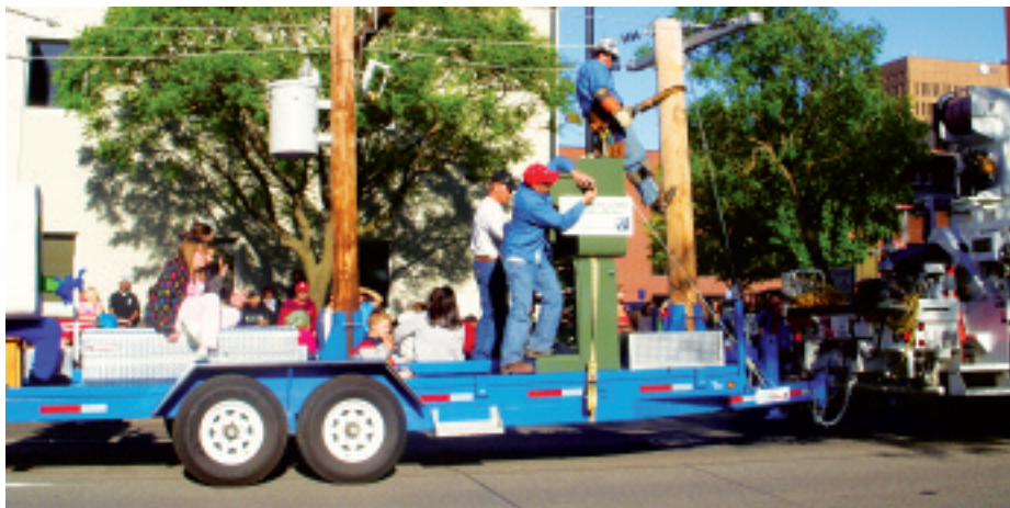
IBEW Local 1523’s float leads parade in Wichita, KS.