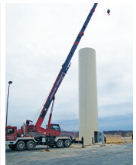
Local 573's new training tower.