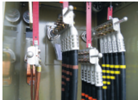
Secondary terminations at Local 1253 Rollins Mountain project.