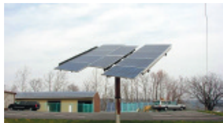
Local 163's new solar array.