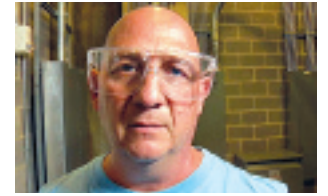
An actor in the IBEW's popular dramatic video

Go to www.youtube.com/theElectricalWorker to watch the video. ■